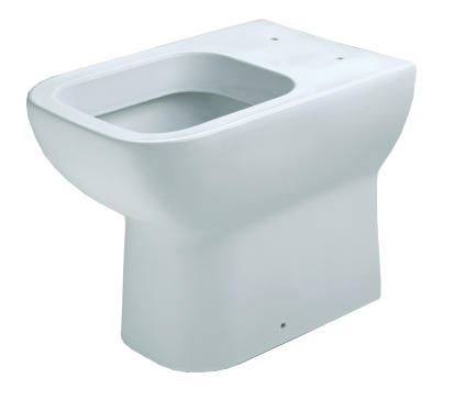
product technical sheet